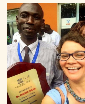
Danielle and South Sudanese human rights activist Edmund Yakani on World Press Freedom Day 2016.